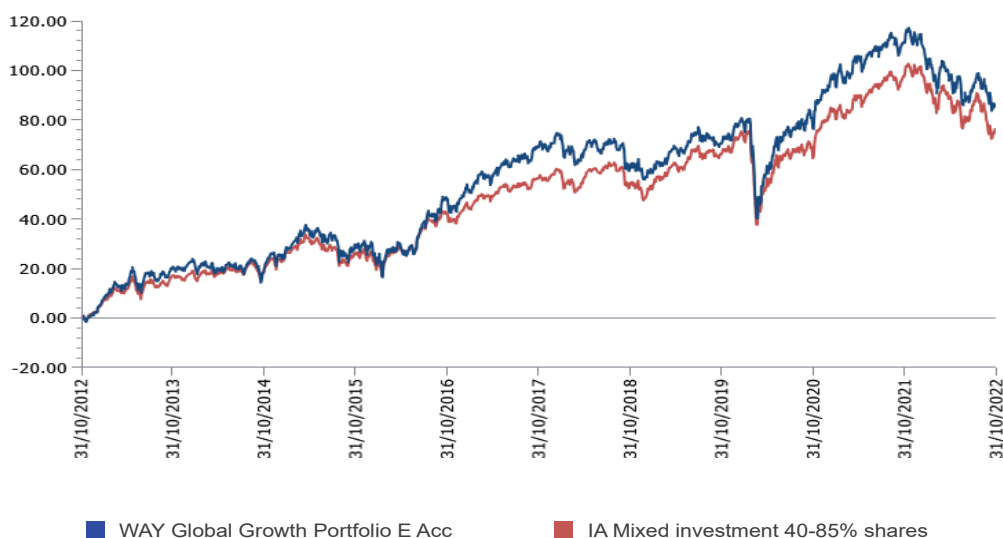
WAY Global Growth Portfolio E Acc* v IA Mixed investment 40-85% shares††

Percentage growth for 10 years to 31 October 2022