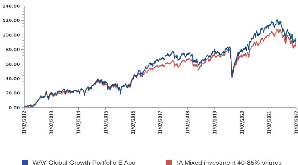
WAY Global Growth Portfolio E Acc* v IA Mixed investment 40-85% shares††

Percentage growth for 10 years to 31 July 2022