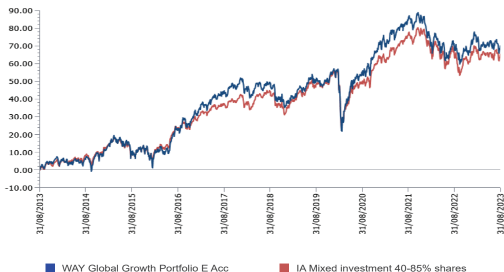
WAY Global Growth Portfolio E Acc* v IA Mixed investment 40-85% shares††

Percentage growth for 10 years to 31 August 2023