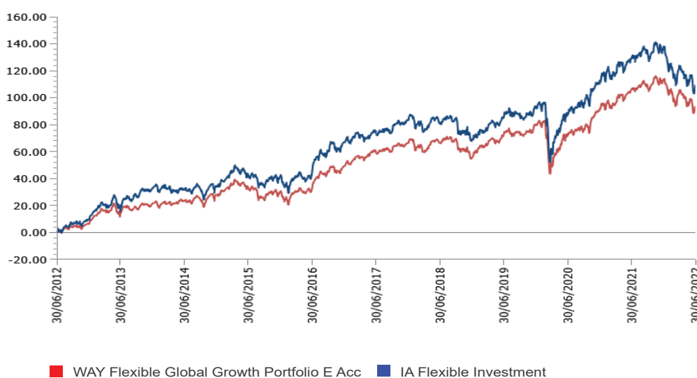
WAY Flexible Global Growth Portfolio E Acc* v IA Flexible Investment

Percentage growth for 10 years to 30 June 2022